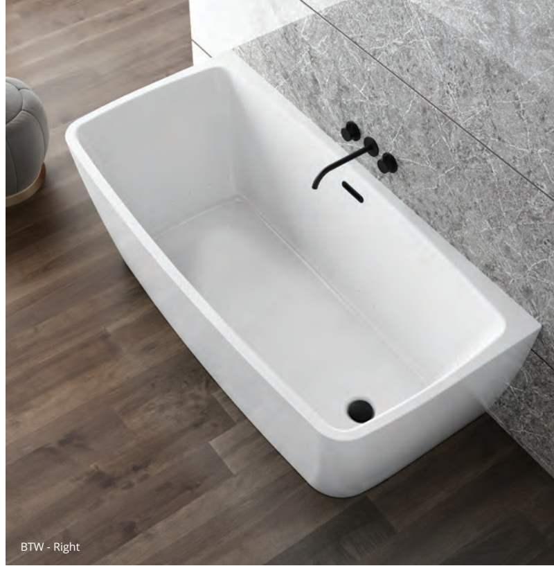
BTW - Right