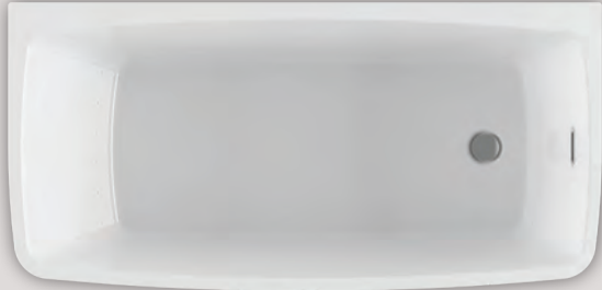
Front Overflow - Right