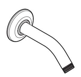
6" Shower Arm & Shower Arm Flange

Visit www.moen.com/support for complete details and limitations