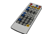
NLSTRA-MSCONT Remote Control for NLSTR-4L1334W/MS